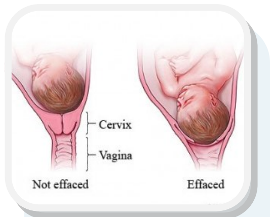
Latent phase of labour.

Once your cervix is effaced and has opened to 5cms this is the start of the active phase of labour for most women. Once you are in the active phase your labour will progress more quickly.